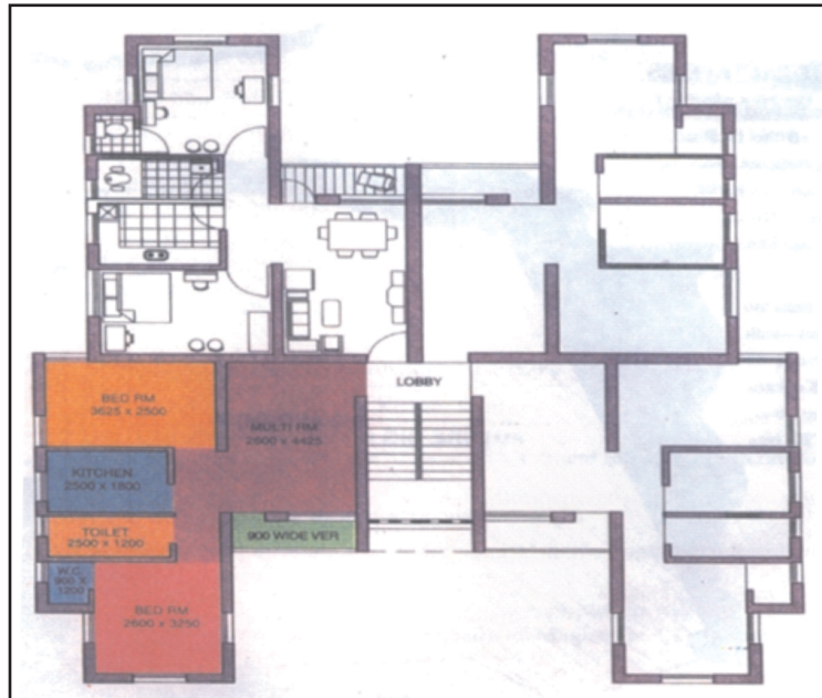
FURNITURE LAYOUT OF FLATS FLOOR PLAN